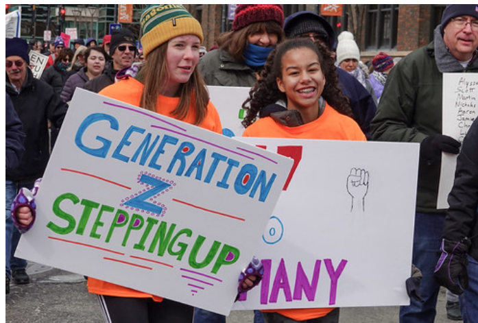
Generation Z

According to the U.S. Census Bureau, the 2018 election saw a 79% increase in voter turnout among people ages 18 to 29 years old compared to the 2014 congressional elections. This is a major improvement over the traditional non-participation by young voters. We're constantly questioning why younger generations are lacking enthusiasm when it comes to voting. Big challenges remain. Generation Z, those born between 1995-2015, has experienced many traumatic instances, whether directly or indirectly, throughout the years. Just to name a few"