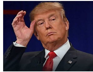
Donald Trump's Advice For Paying Off Mortgage (It's...) Bills