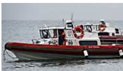
Russian divers find jet fragments in the Black Sea