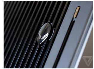
Is This the World's Most Overpowered Retail PC? The Verge