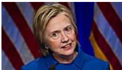
New debate over Clinton reaction to election loss