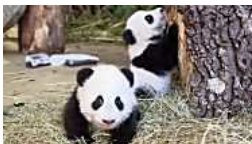
Adorable twin baby pandas enjoy playtime after check-up