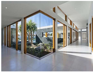
Use Data To Sell Your Home For More Homelight