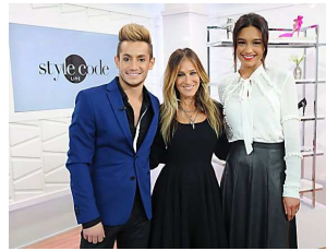
How Sarah Jessica Parker Gets Her Amazing Curls... Amazon.com